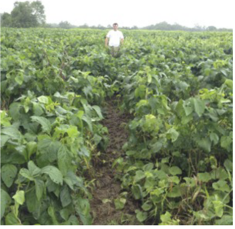
This is one of our seed fields. The plants are about 6 weeks old. The picture was made 8/28/2012. The beans were planted around 7/15/2012. Before harvest we could hold the vines up and they were over head high.