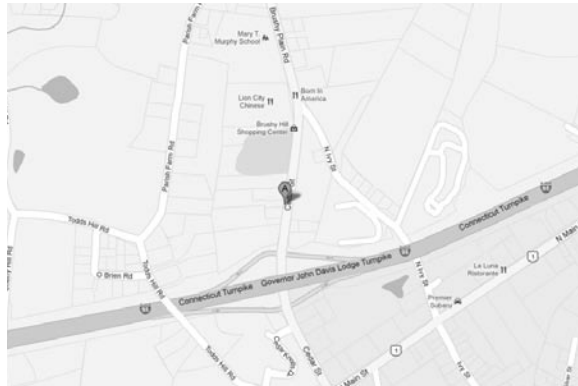
174 Cedar St. Branford