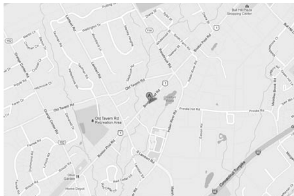
304 Boston Post Rd. Orange