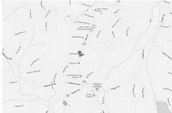
517 Main St. Monroe, CT

The best way to choose styles and colors is to see the items in person. Visit one of our showrooms to see, touch, mix and match as much as you like.