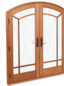
Arch Top French Door