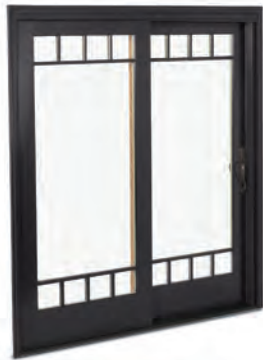
Sliding French Door