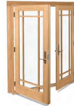
Ultimate Inswing French Door