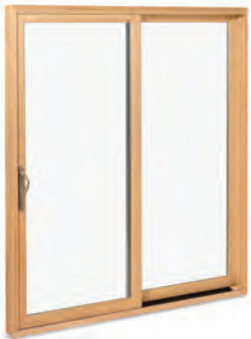
Sliding Patio Door