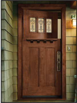
Jeld-Wen Windows & Doors