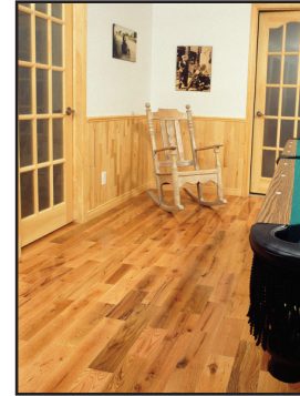
BSL Wood Flooring