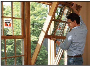
Andersen Windows & Doors