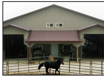
ABC Metal Roofing