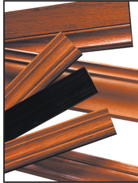
Moulding & Millwork