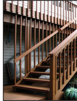
Duckback Paint & Stain