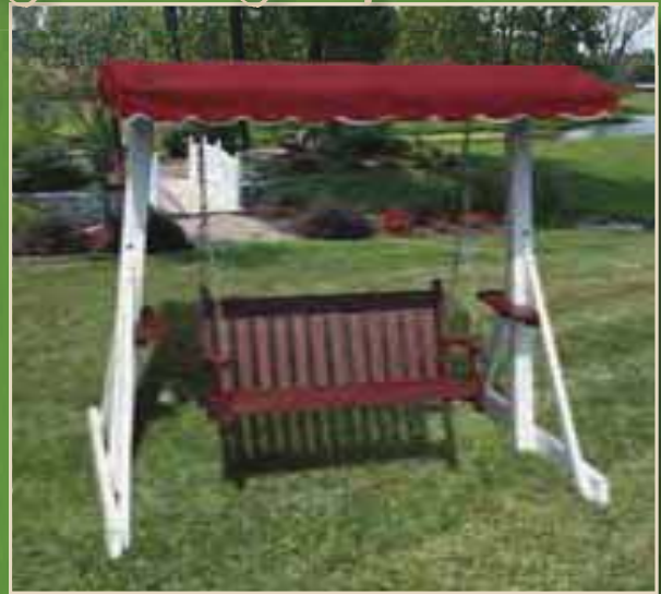
Garden Swing (item P41): Garden Swing with adjustable canopy cover (item P42). Shown with English Swing (item P24) available in green or burgundy.