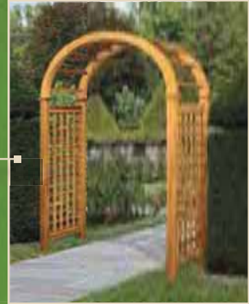
New England Round Top Arbor Item A04