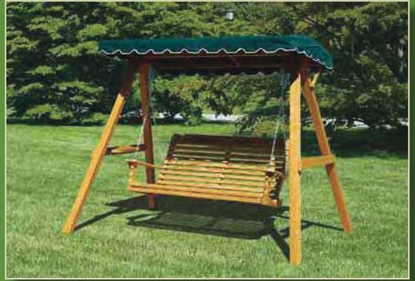
A-Frame with Canopy (item C54) A-Frame without Canopy (item C53) Swing Ordered Separately. Shown with 5ft. Countryside Swing (item C18)