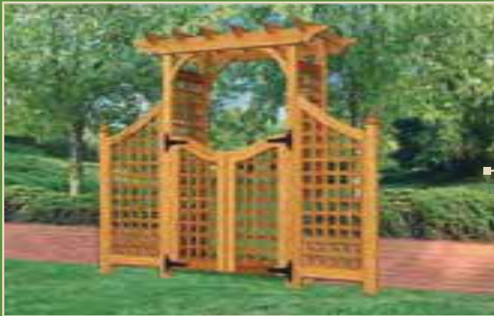
Colonial Straight Top Arbor: Opening width of 45" (item A10) or 60" (item A12), standard depth 28". Shown with optional wing extensions (item A40) and gates (item A47). Choice of diagonal or square lattice.