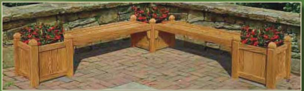
Double Bench Seat and Planter Combo: 19" square planter box with plastic liner (item C61) and 52" bench seat (item C70).

Wolmanized® Residential Outdoor® Wood has earned the Good Housekeeping Seal.