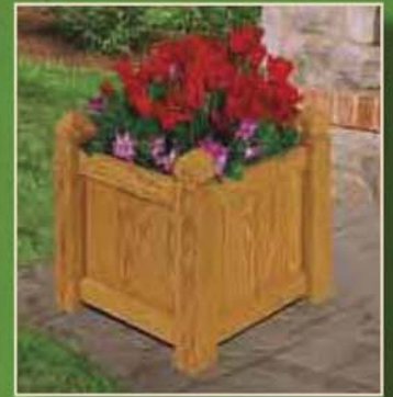
19" Square Planter Box with plastic liner (item C61)