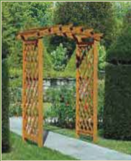
Petite Arbor: Opening width 36" (item A06), depth 25", diagonal lattice.