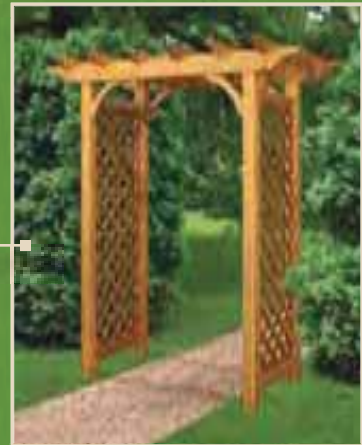
Colonial Straight Top Arbor Item A10