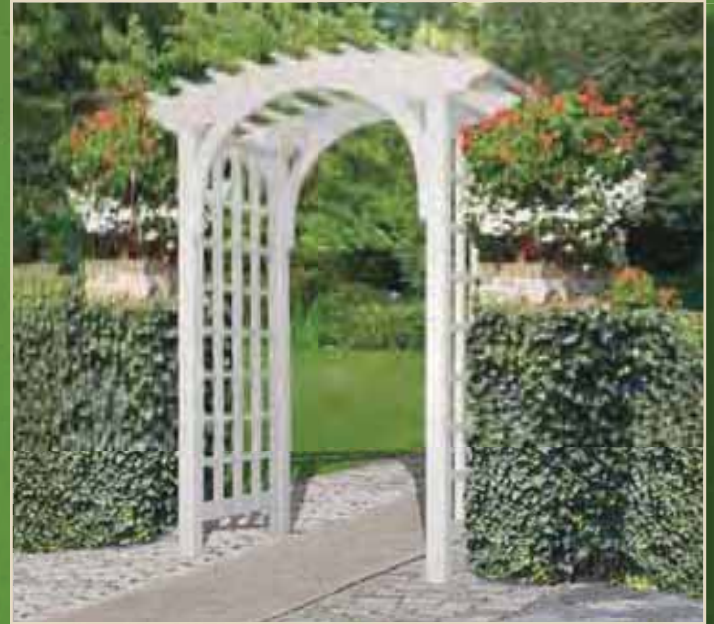
Berkeley Heights Arbor (item A19): Opening width 48", depth 35", square lattice.

The Countryside Estate Collection has been created by our designers using the long lasting material combination of poly lumber and vinyl encased wooden posts. This material selection allows us to not only produce classic styles which are strong and durable, but they are virtually maintenance free.