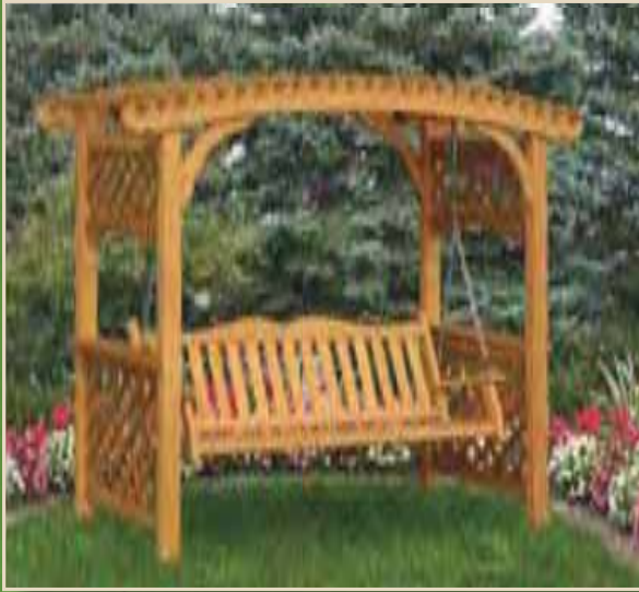
Lakeside Swing Arbor: Opening width of 80" (mid 2009 design change to 70"), approximate roof depth 48" (item A09). Swing ordered separately – shown with English style 5' swing (item C25). Diagonal lattice.