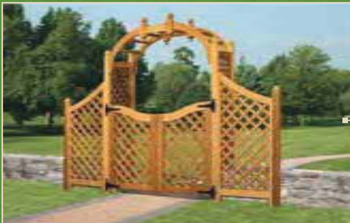
Victorian Round Top Arbor: Opening width of 45" (item A01 and A05) or 60" when extension is added (item S60). Standard depth 28". 60" opening width shown with optional wing extensions (item A41) and gates (item A48). Choice of diagonal lattice/gothic posts or square lattice/estate posts.