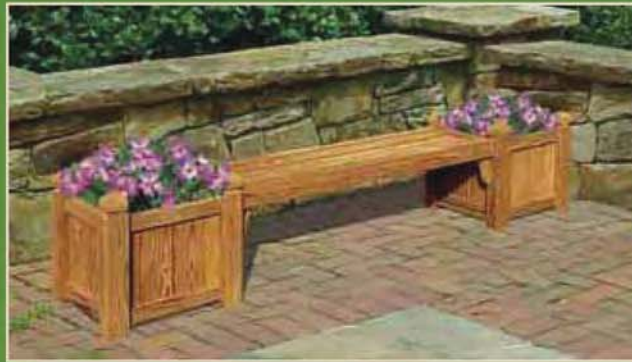
Single Bench Seat and Planter Combo 19" square planter box with plastic liner (item C61) and 52" bench seat (item C70).