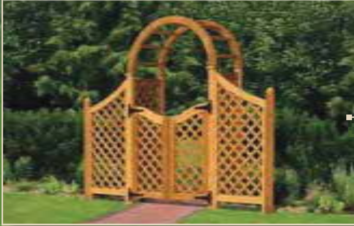
New England Round Top Arbor: Opening width of 45" (item A03) or 60" (item A04), standard depth 28" or 40". Shown with optional wing extensions (item A41) and gates (item A46). Choice of diagonal or square lattice.