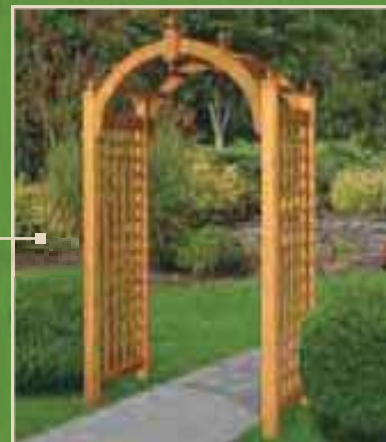
Victorian Round Top Arbor Item A05

** Arbor Anchor kits are available. Please order separately.