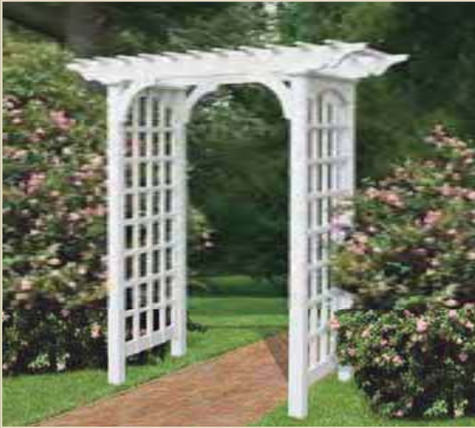
Fairfax Ranch Arbor (item A18): Opening width 48", depth 35", square lattice.

The classic styling of these wood alternative structures complements your garden's natural style and adds an elegant focal point to any walking path.