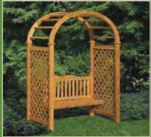
Grandview Bench Arbor: Opening width of 60", depth 40" (item A17). Can be ordered without bench kit (subtract item A68). Diagonal lattice standard.