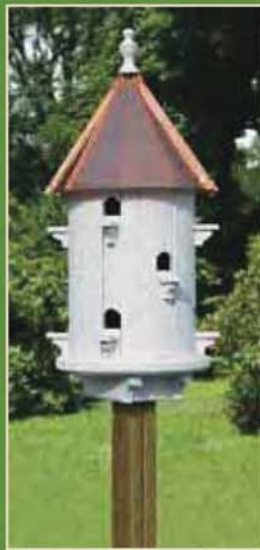
Copper Top Martin House: (item C87) Post not included.