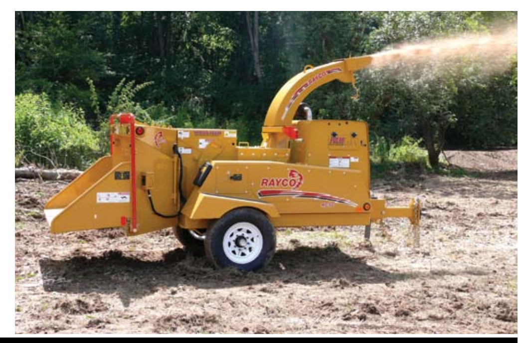
RC6D • RC6DV