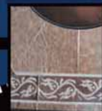
Decorative Tile Mantel