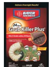
24-Hour Grub Killer

*These tips are recommended by Agway of Cape Cod, without guarantee of success. Always follow instructions on each product label for appropriate usage. ©2015, Agway of Cape Cod