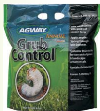
Season Long Grub Control