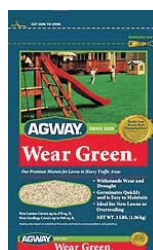
Wear Green Grass Seed