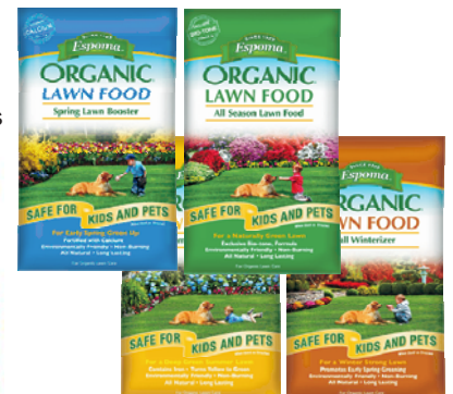
Espoma 4 Season Lawn Program