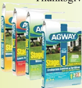
Agway 4-Stage Program